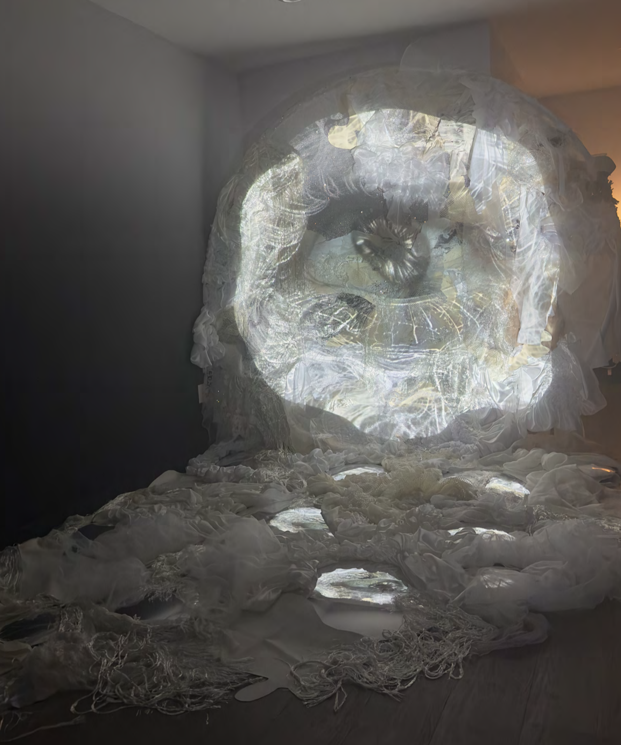
Clandestina Art Fair Project in collaboration with Ocovisual Miami, FL - 2024