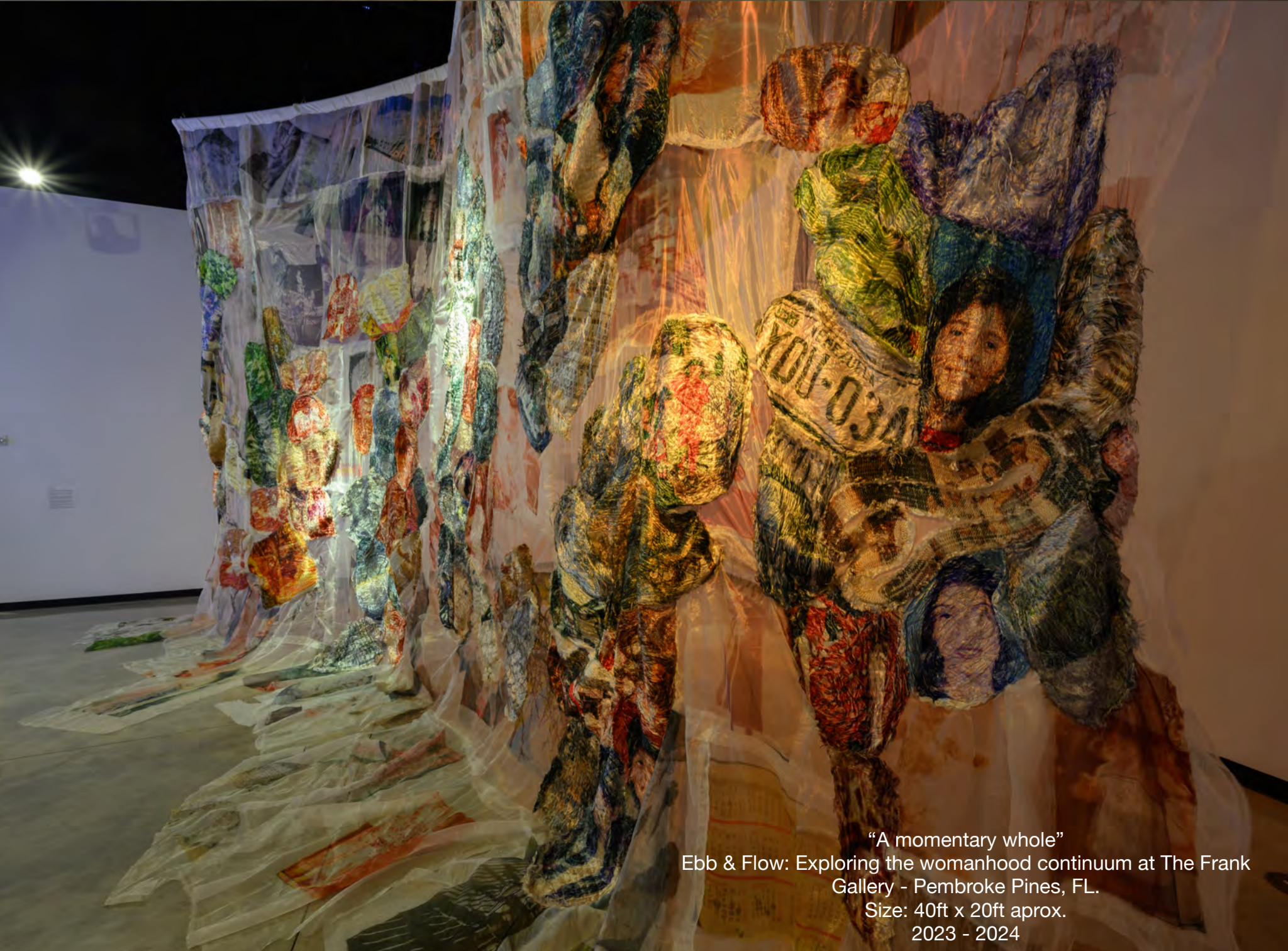
“A momentary whole” Ebb & Flow: Exploring the womanhood continuum at The Frank Gallery - Pembroke Pines, FL. Size: 40ft x 20ft aprox. 2023 - 2024