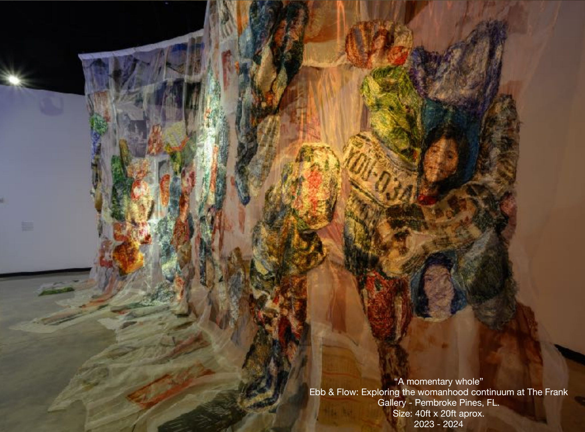
“A momentary whole” Ebb & Flow: Exploring the womanhood continuum at The Frank Gallery - Pembroke Pines, FL. Size: 40ft x 20ft approx. 2023 - 2024