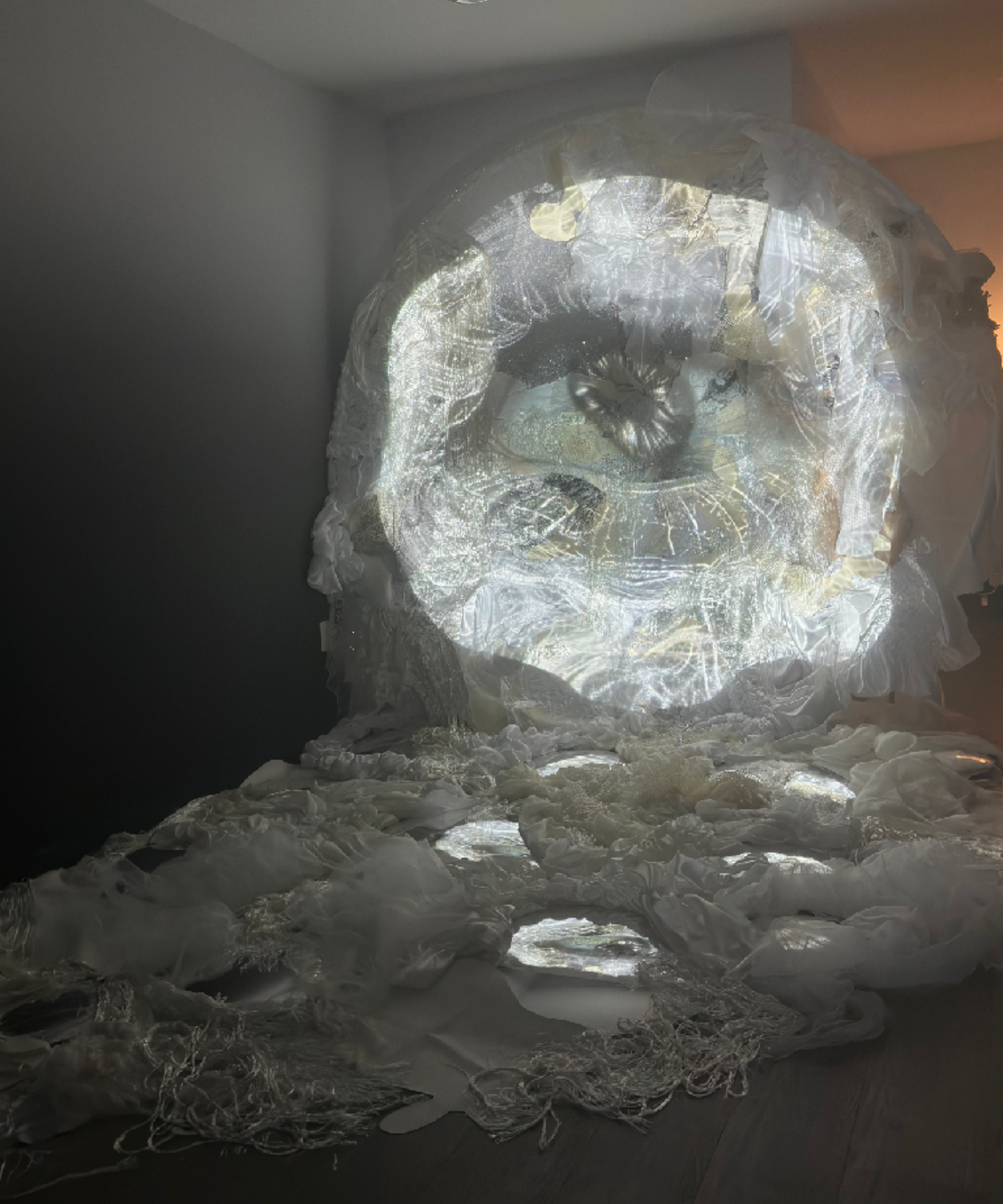
Clandestina Art Fair Project in collaboration with Ocovisual Miami, FL - 2024