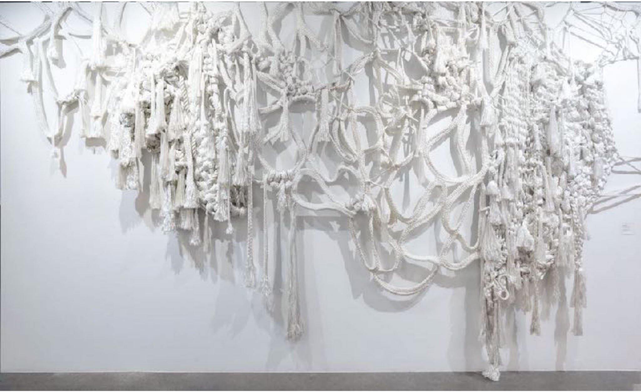
Women of Vision Exhibition: South Florida Women Artists at Large, Curated by Dainy Tapia, Doral Contemporary Art Museum, Doral FL