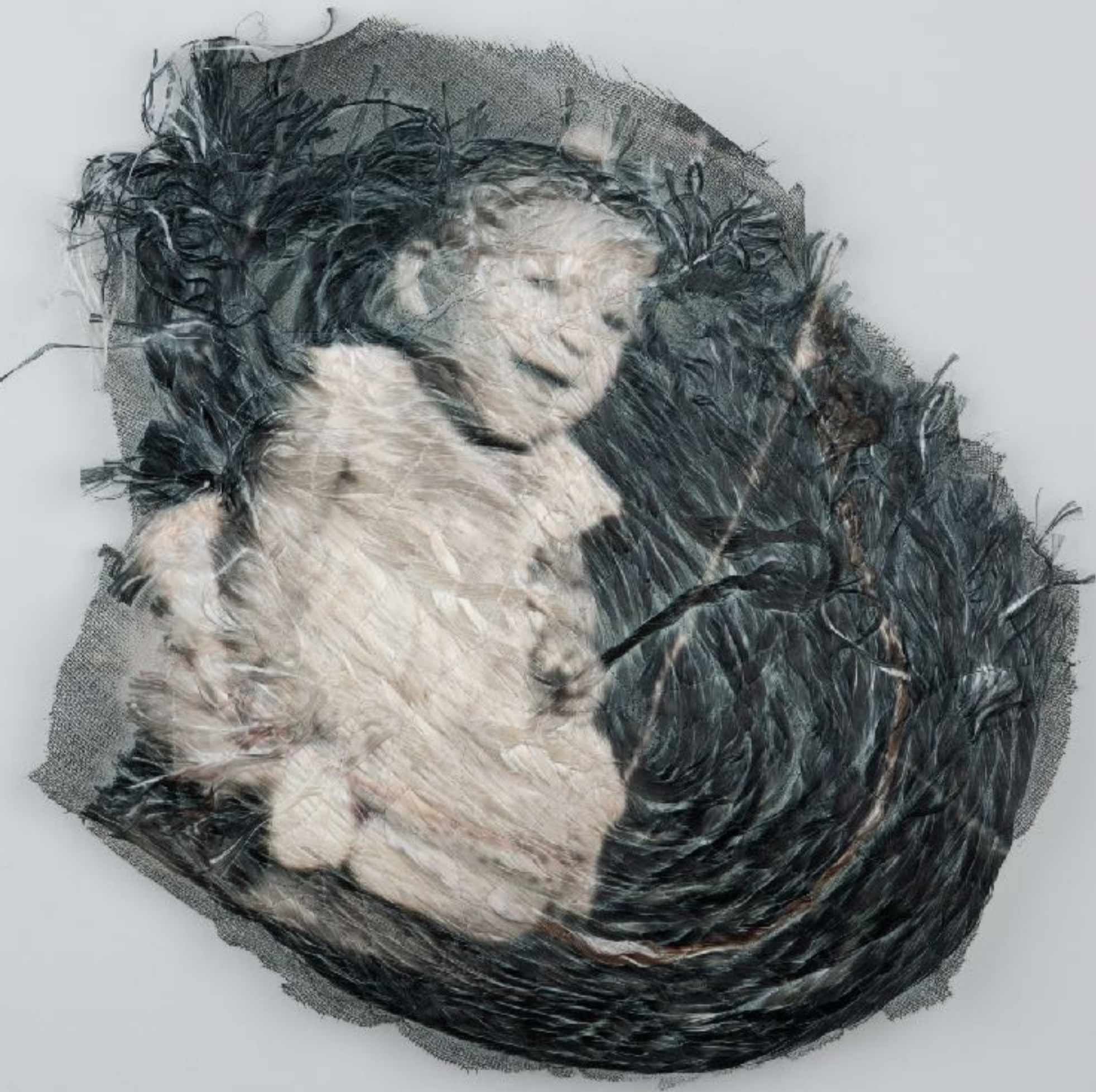
Title: La Nieta Medium: Photography printed on prepared textile Size: 19" x 15" inches 2024