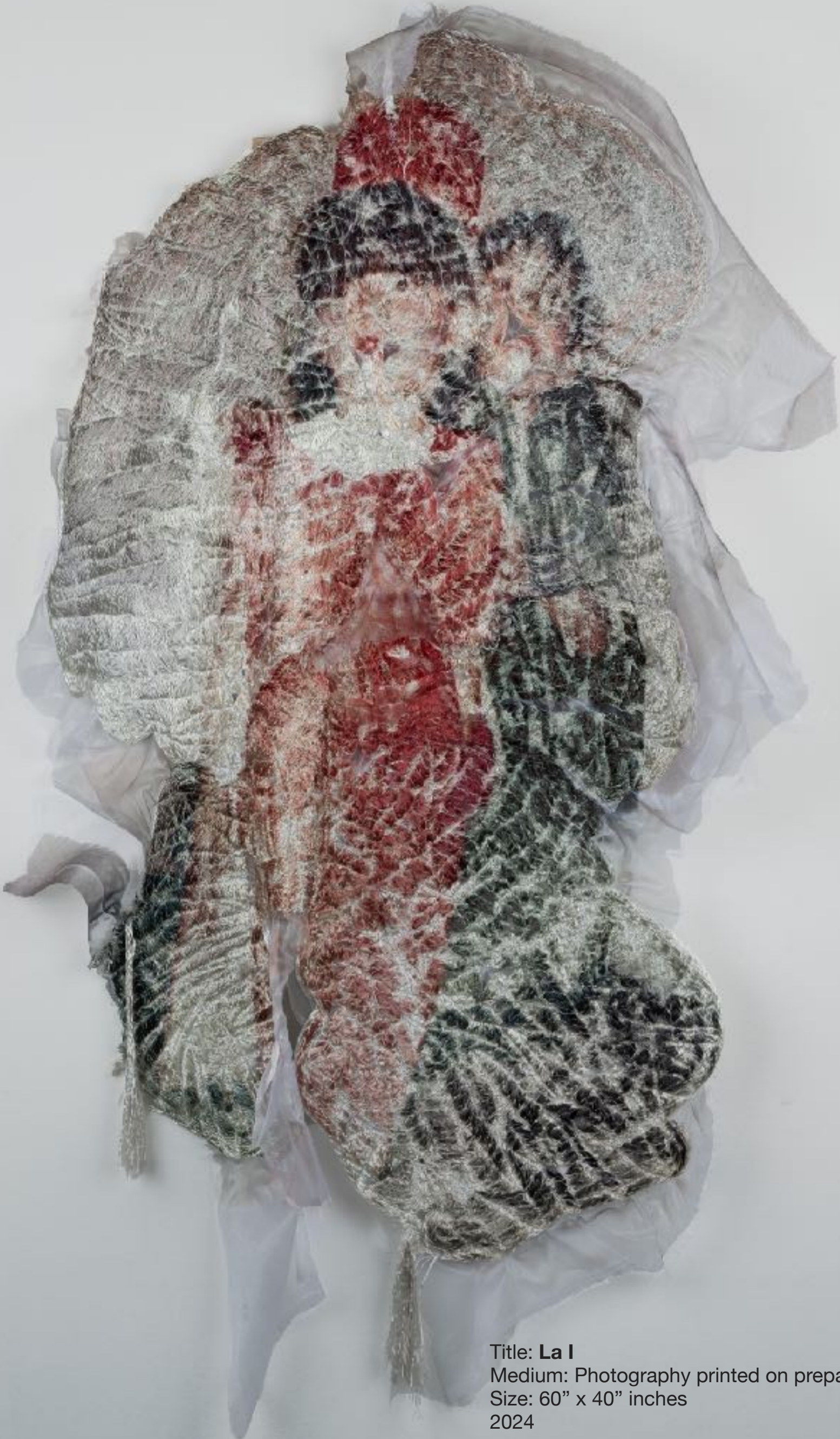
Title: La I Medium: Photography printed on prepared textile Size: 60" x 40" inches 2024